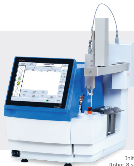
Initiator+ with Robot 8 shown here.

The 8-position sample bed gives the user a compact automation solution to start their scale-up process and library build-up in a multi-user environments with queuing. The 60-position sample bed supports the production of focused libraries, multi-user environments and scale-out.